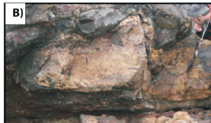
Field photographs accompanying field sketches of Figure 6 within paper