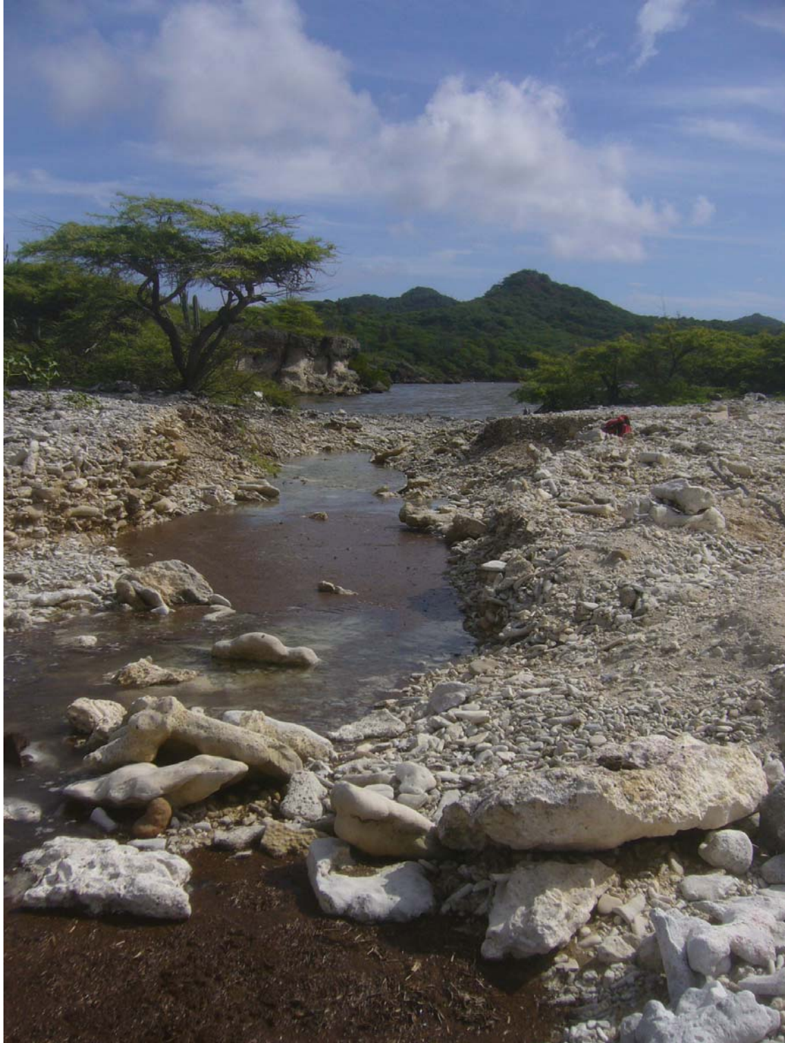
Figure DR1. Overview of the outcrop on Playa Funchi shown from West to East. Salina Funchi is located in the background.

Sedimentology and hydrodynamic implications of a coarse grained hurricane sequence in a carbonate reef setting.