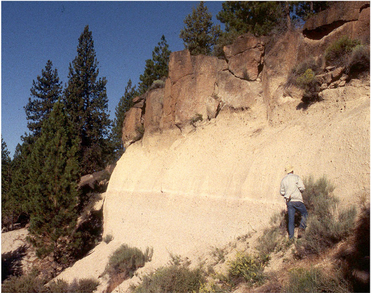
Figure 2. Bend Pumice tuff and the Tumalo Tuff exposed in quarry face. The white layer at about the level of the white belt of the man standing by the cliff is a traction layer or surge layer, at the base of the Tumalo Tuff, an ash flow. The tephra below these is the Bend Pumice, a coarse air-fall pumice layer. In the latter unit, the pumice clasts are in contact with each other, and finer ash fills the interstices between them. A rough layering can be seen in this lower unit. The overlying Tumalo Tuff consists of an ash matrix, with clasts of pumice and rock suspended within the matrix. These clasts are not in contact with each other. The dark-brown rock above the ash-flow is a partly-welded upper part of the Tumalo Tuff. The Bend-Tumalo Tuff is ~435 Ka in age, with K-Ar and ^{40}\text{Ar}/^{39}\text{Ar} ages ranging from 400 to 470 Ka. The chemical composition of the fall pumice and overlying ash flow are essentially the same. Location east of Triangle Hill, west of Bend, in central Oregon. We assigned stratigraphic number (SN) 31 to this unit in northern California and the greater San Francisco Bay area.