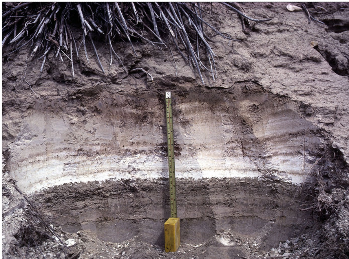
Figure 1. Photo of an exposure of air-fall ash and reworked ash. A basal layer of pure white ash, ~1.5 cm thick, is exposed at the base of this unit, and is the result of direct air-fall. Above this is a ~3-cm thick layer composed of finer laminae and layers, less pure than the basal layer; this is reworked ash that has been brought into this depositional basin from surrounding highlands by streams and wind (?). Above the latter, there is a ~9-10 cm thick layer or layers and laminae of progressively less pure ash, which is mixed in with the local detrital sediment lithology. Above the latter is sediment that is the same in color as the sediment underlying the ash, indicating that the ash has been mostly cleared out from the nearby highlands during successive storms. Tuff of Blind Spring Valley, ~2.19 Ma, in the Beaver Basin of southwestern Utah, erupted near and east of Long Valley caldera in east-central California (Sarna-Wojcicki and others, 2005)

tephra layer is close to the base of the unit, where the original comagmatic components, the volcanic glass and minerals, are most likely to be present, but sufficiently above the base of the